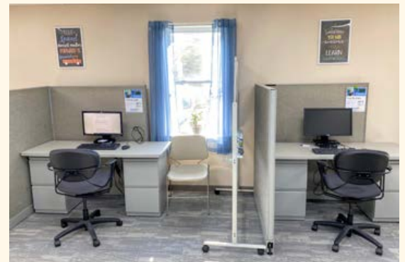
Work stations for clients to use at no cost