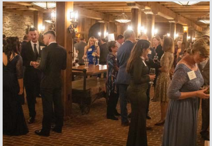
ECHOS of Hope Gala Silent Auction and Cocktail Hour