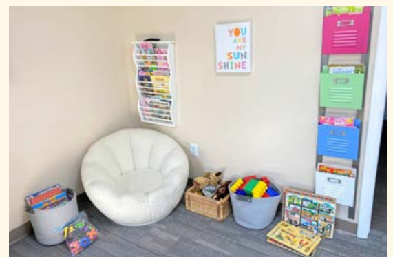
Space for children that need to accompany a client