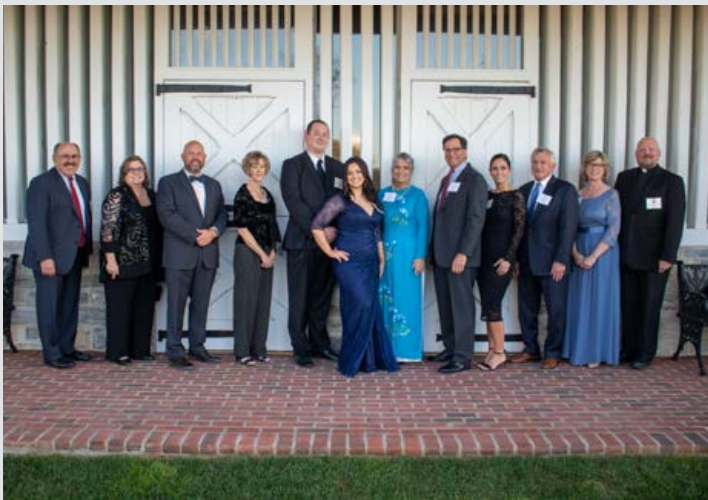
ECHOS Board of Directors and Executive Director

With the gala over for this year, our thoughts are set on making next year's gala even more spectacular and impactful. Stay tuned for more information!