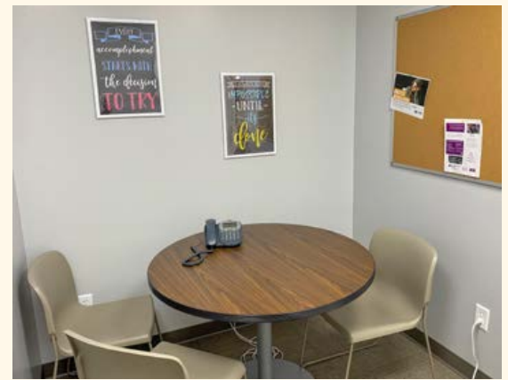
Private rooms for advocates and community partners to meet with clients